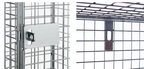
Hasp & Staple Lock