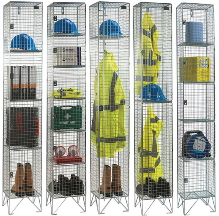
4 compartment 1 compartment 5 compartment 6 compartment 2 compartment